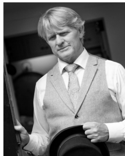
Brandon 2A Thetford Road | Brandon | IP27 0BS Telephone: 01842 811245 Email: brandon@turnerfunerals.co.uk