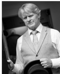
Brandon 2A Thetford Road | Brandon | IP27 0BS Telephone: 01842 811245 Email: brandon@turnerfunerals.co.uk